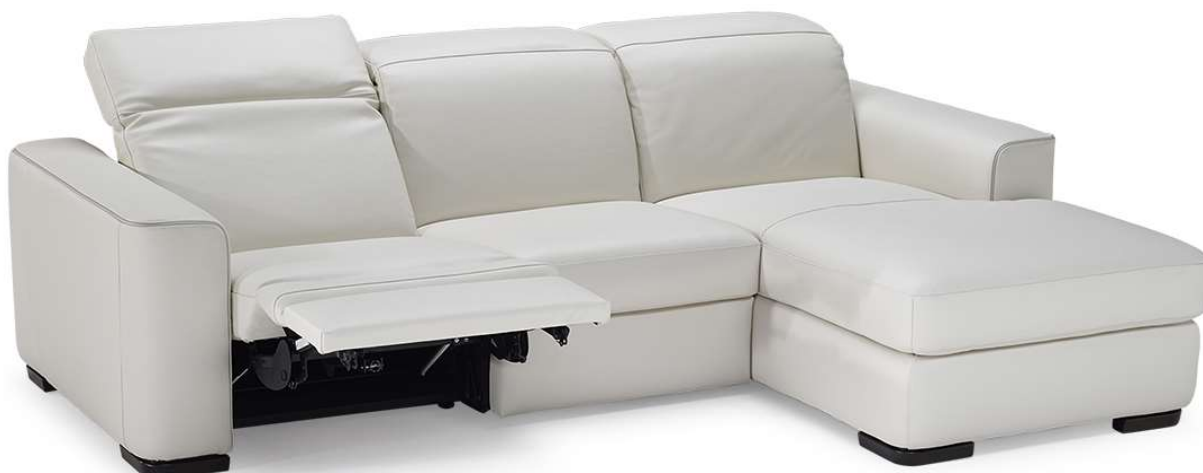
■ Vers. 182+049